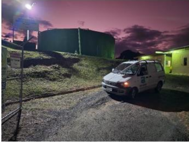
WAF Rakiraki WTP