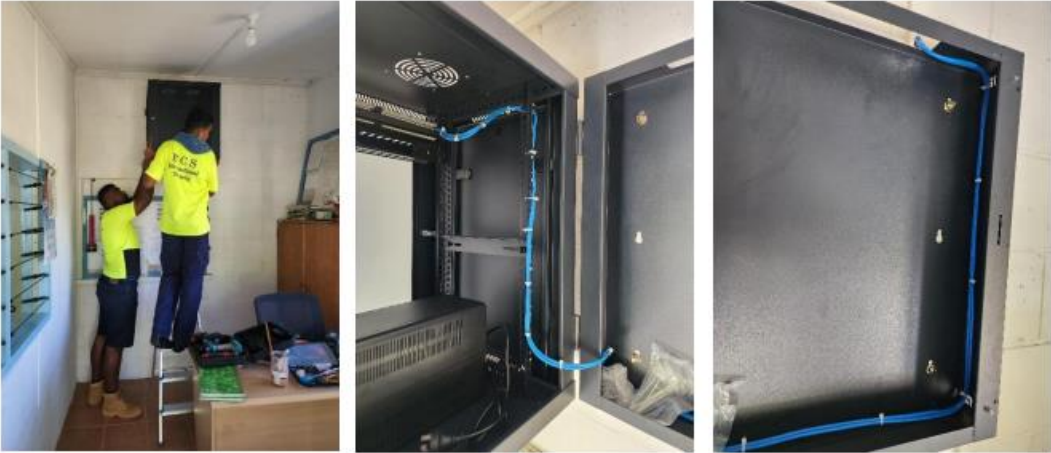
WAF Naboro STP