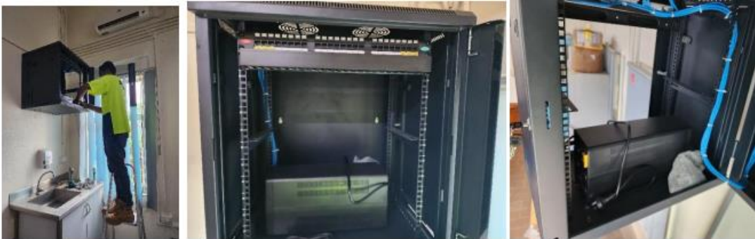
WAF Nagado WTP