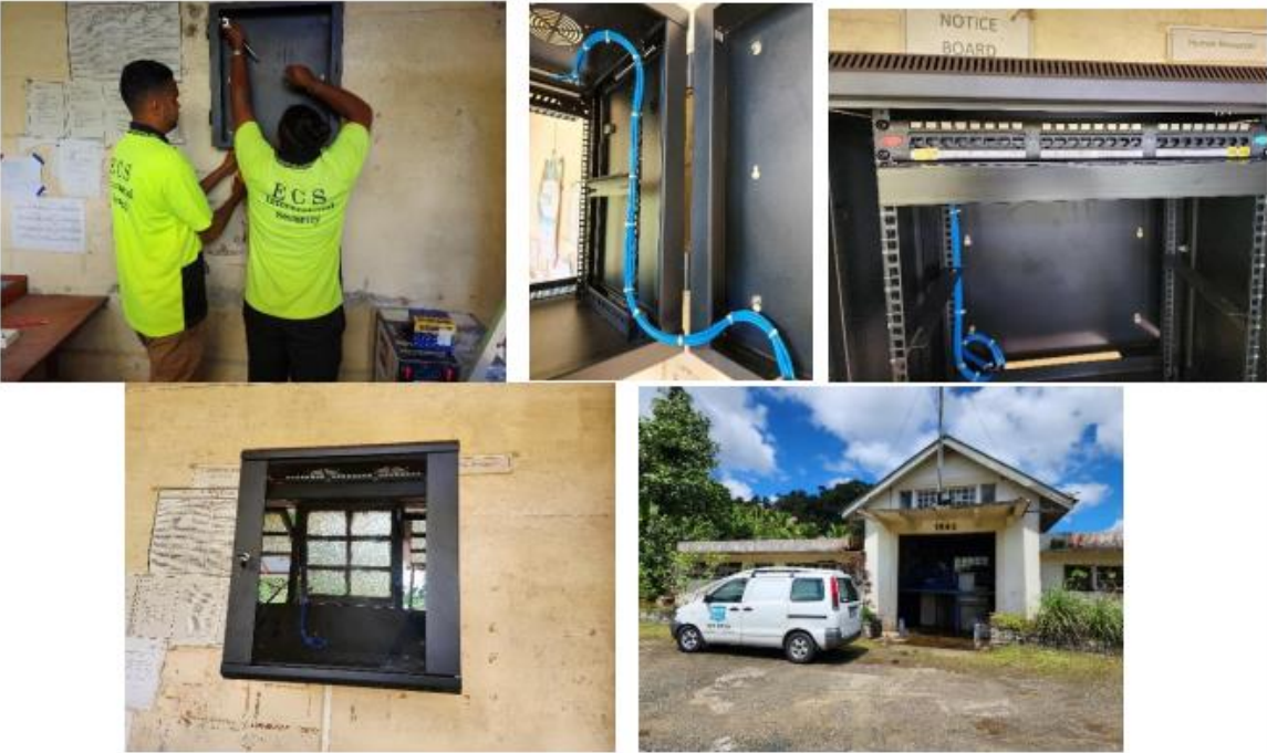
WAF Savura WTP