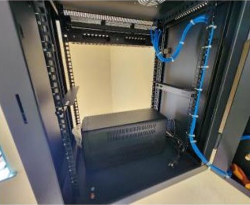
WAF Deuba WTP